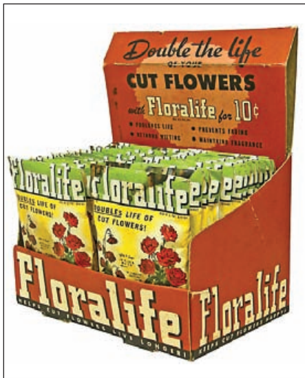
A vintage Floralife display box.

Another featured a classic Hollywood actress of the 1930s and 1940s, Joan Bennett, who appeared in the 1933 version