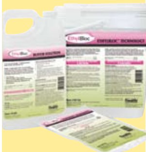
EthylBloc™ Technology Truck Treatment