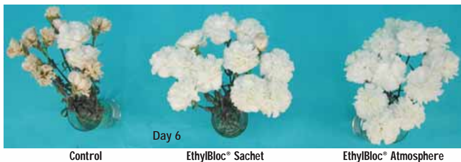
Figure. Effects of EthylBloc sachet and atmosphere treatments on carnations.