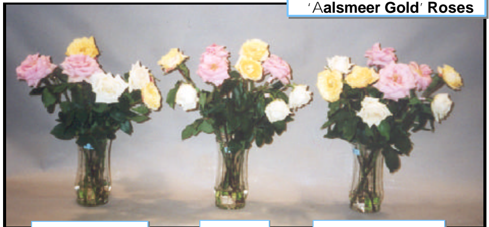
Floralife® Quick Dip®